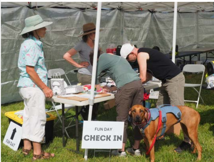
Fun Day activities & games sign-up

Thanks again, Marykay, and all who volunteered!