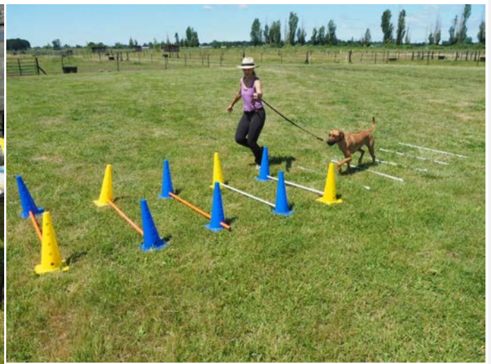
Getting some cavaletti practice