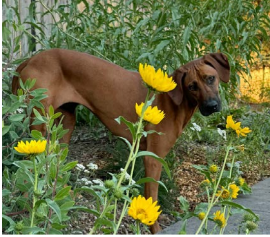
Taking a break from hunting rodents.