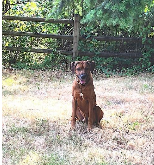
Zak on a training break at Lake Stevens, WA (Lorraine Pedersen)

Have casual pics of your pup? We'd love to feature them in the next issue! Send them to info@atlassmarketing.com