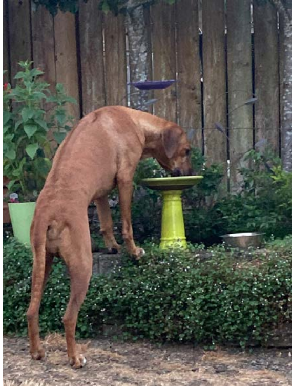
Really big bird, Ridley, getting a drink