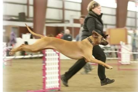
Running agility with Alta