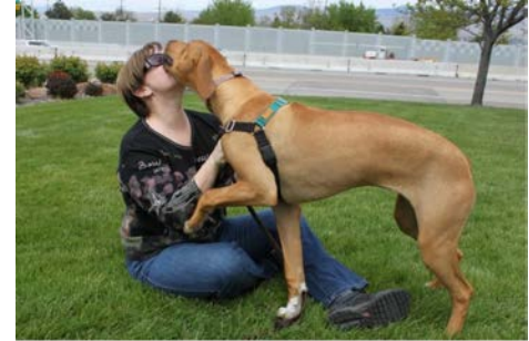
Getting some liver love