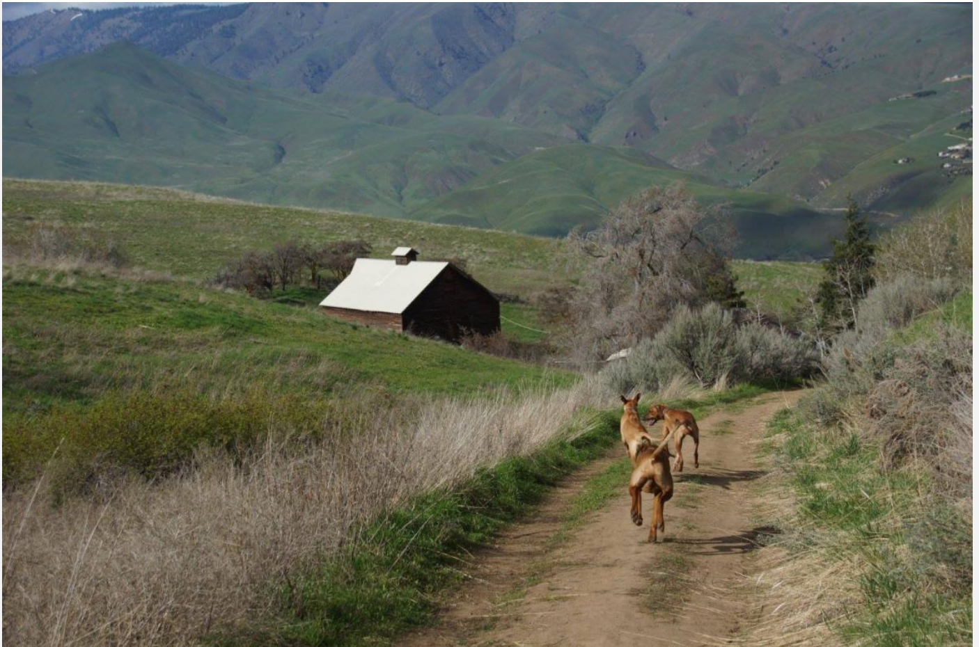
Racing into Summer (Betsy Metcalf)