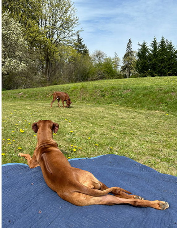
Ember & Ash basking in the lovely weather