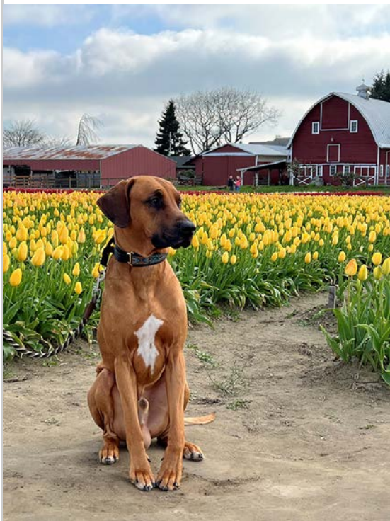
Loki tiptoeing through the tulips! (Anneke Zwick)